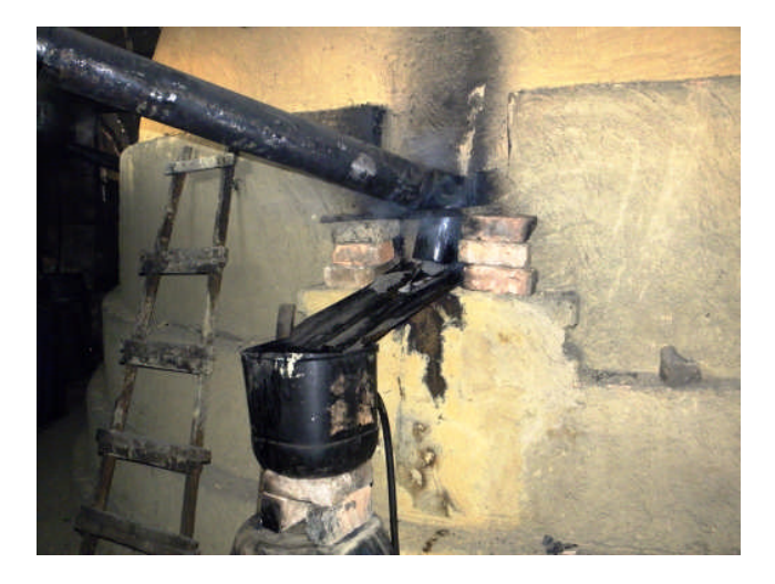
Fig. 1. Smoke from the mangrove charcoal kiln is condensed and collected as wood vinegar

In Matang Mangroves, Perak, Malaysia, wood vinegar or pyroligneous acid is a by-product of charcoal making from the billets of Rhizophora . Smoke from the vents of charcoal kilns is condensed in steel tubes and collected in plastic drums as raw distillate (Fig. 1).