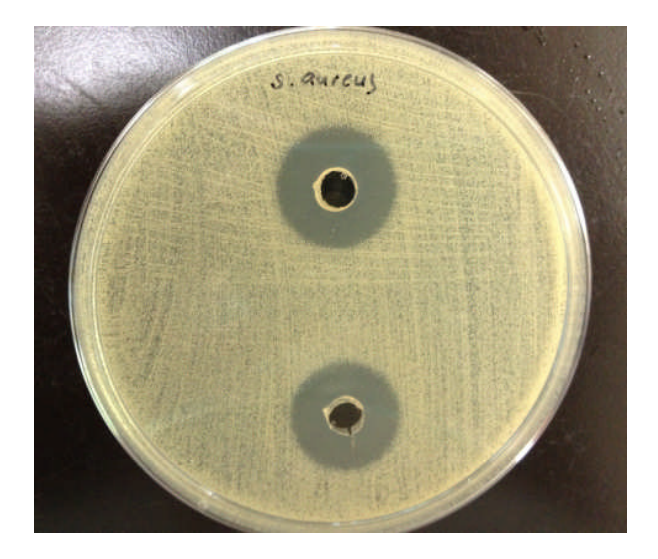
Fig. 3. Inhibitory zones of non-distilled (top) and distilled (bottom) wood vinegar against Gram-positive S. aureus

Against Gram-positive bacteria (Fig. 3), DIZ ranged from 15 \pm 1 \text{ mm} (distilled and non-distilled wood vinegar for B. cereus ) to 28 \pm 2 \text{ mm} (non-distilled wood vinegar for M. luteus ) (Table 1). In terms of DIZ, there was no significant difference at p < 0.05 between distilled and non-distilled wood vinegar. MIC was 6.25% for B. cereus , and 12.5% for M. luteus and S. aureus .