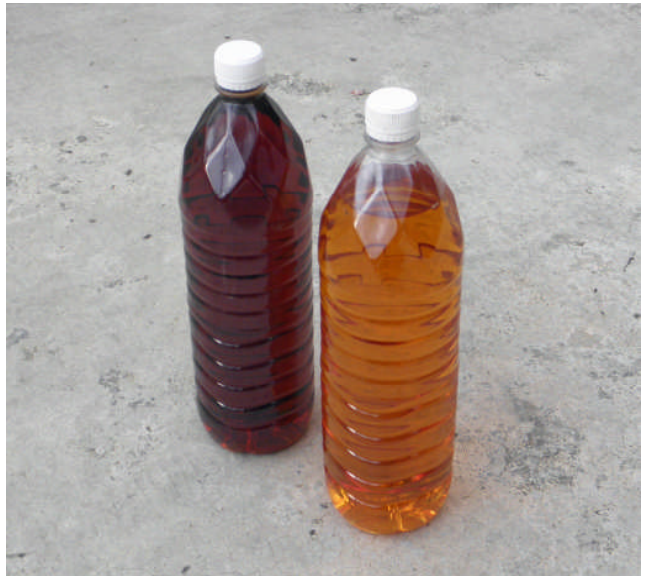
Fig. 2. Bottles of non-distilled (left) and distilled (right) mangrove wood vinegar

Two bottles of wood vinegar produced by a factory in Matang Mangroves were tested for antibacterial activity. Non-distilled wood vinegar is dark brown in colour, resembling coffee (Fig. 2). After distillation, it becomes golden brown, resembling tea.