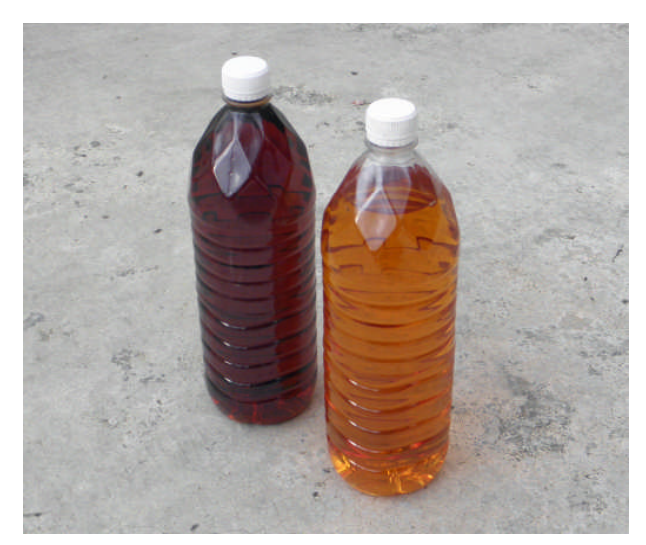
Fig. 2. Non-distilled (left) and distilled (right) mangrove wood vinegar

Two bottles of wood vinegar produced by a factory in Matang (Fig. 2) were tested for antioxidant and antityrosinase activities. The non-distilled wood vinegar is dark brown in colour, resembling coffee. After distillation, it becomes golden brown, resembling tea.