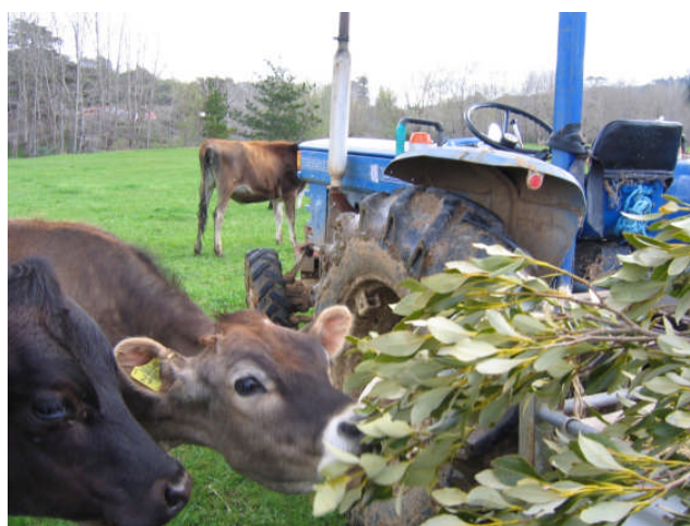
Fig. 1. Yearling heifer (young female cattle) eating Avicennia foliage on a New Zealand dairy support farm, even before it was placed on the grass paddock

This paper reports some results from an on-going series of field experiments on a New Zealand dairy support farm (Waikato region, 35° South). Mobs of 50 mostly yearling heifer cattle were given a grazing selection of three types of herbage: freshly collected A. marina foliage (leaves, twigs and sometimes propagules), hay (summer-saved pasture) and new break of fresh pasture (rye-grass plus two species of clover) (Figs. 1 and 2).