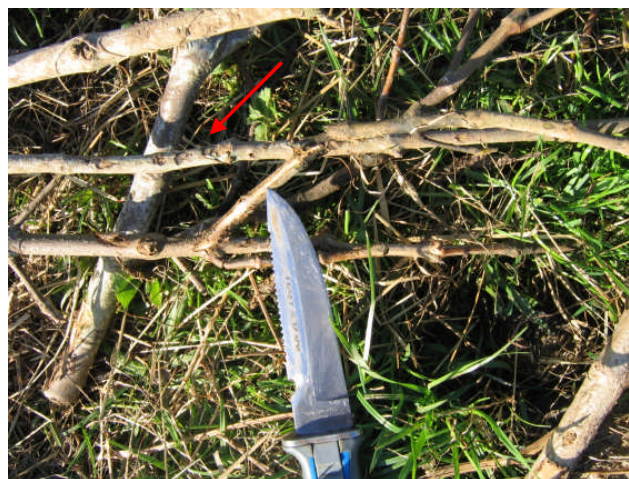
Fig. 4. Bark gnawing by cattle (arrow) on twigs of Avicennia marina

Data in Fig. 3 showed strong preference for mangrove foliage. Typically, once the cattle had made their herbage choice, they consumed all the available Avicennia foliage before feeding on the pasture (next choice) or hay (last choice). Mangrove material was almost totally defoliated and gnawing of bark was evident (Fig. 4). Bark gnawing was exhibited on 90% of twigs inspected from 60 branches used in the three trials.