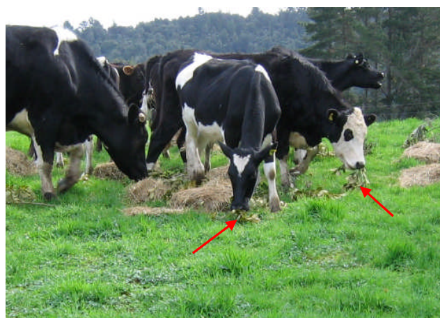
Fig. 2. Young cattle actively selecting Avicennia foliage (arrows) over pasture and hay