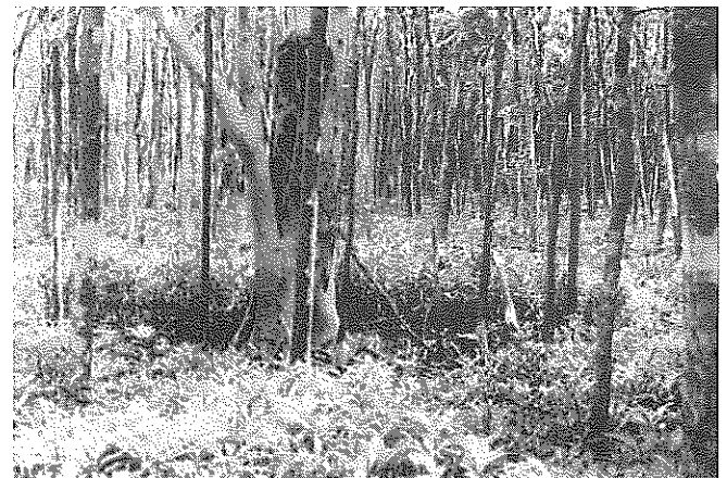
In one of the small uninhabited islands, the land area of which is less than 2 km 2 , there still remain beautiful mangrove forests dominated with big trees of Avicennia marina , more than 20 m in height and 80 cm in DBH.