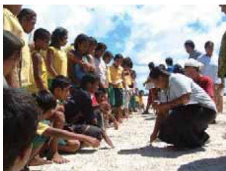
Kiribati, 2005