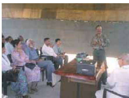
Pakistan, 1995, K. Tsuruda