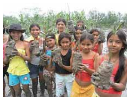
Brazil, 2007, T. Tsuji