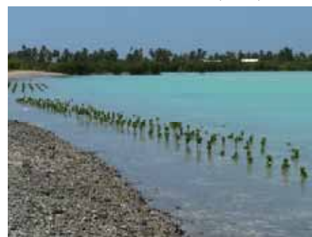
Kiribati, 2009