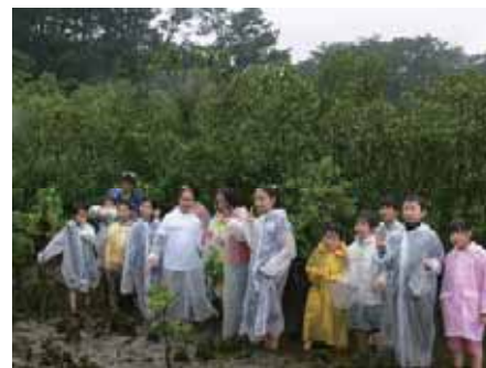
Study tour, 2008, S. Yamagami