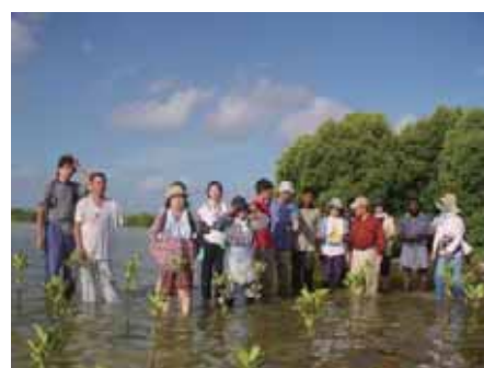
Maldives, 2001