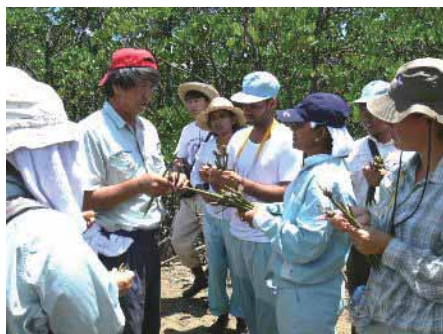
Training Course, 2007, S. Yamagami