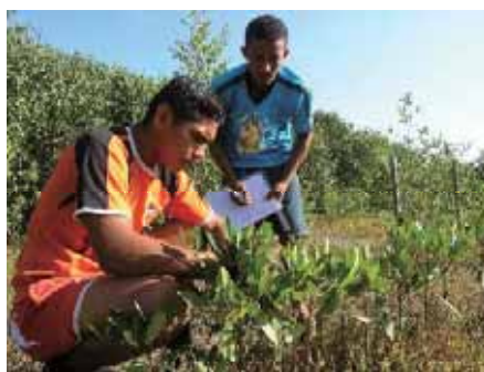
Brazil, 2007, T. Tsuji