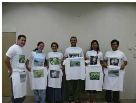
Training Course, 2007, S. Yamagami