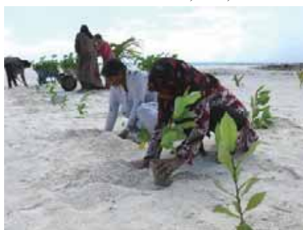
Maldives, 2007