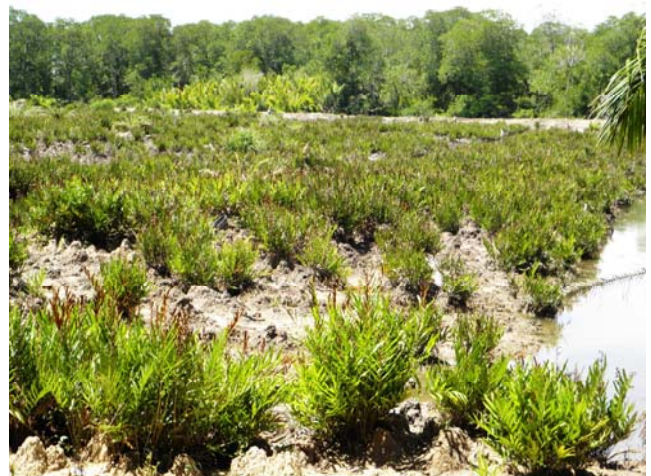
Trial area besides Sungai Lalasun for initial planting of Rhizophora mucronata