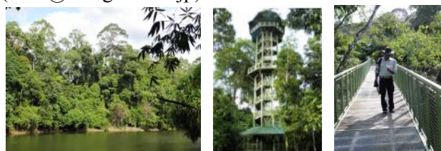
The Rain Forest Discovery Center in Sandakan

Please contact ISME Secretariat for pre-registration ( isme@mangrove.or.jp )