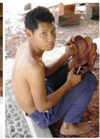
Aboriginal wood sculptures from Xylocarpus moluccensis .