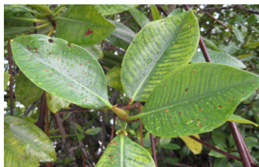
Fig. 4. Clear venation pattern on some hybrid(s)