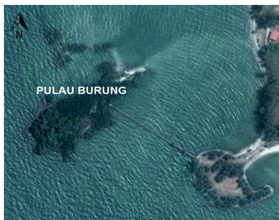
Fig. 1. Aerial view of Pulau Burung (Google Earth)

In Malaysia, the first encounter of a Rhizophora hybrid was reported by Chan (1996). Rhizophora × lamarckii Montr. was growing alongside its putative parents, Rhizophora apiculata Bl. and Rhizophora stylosa Griff., on Pulau Burung (Fig. 1), an islet off the coast of Port Dickson in Negeri Sembilan. The morphological features of R. × lamarckii have been described by several authors (Chan, 1996; Duke, 2006, 2010). Here are further descriptions of the Rhizophora hybrid population on Pulau Burung (2°32'N, 101°47'E) observed during a field survey conducted in March 2012. All trees of R. apiculata , R. stylosa , hybrid(s) including Rhizophora mucronata Lamk. were in flower.