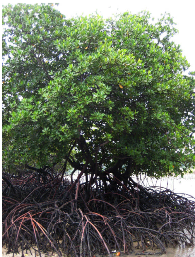
Fig. 5. Vigorous growth of a Rhizophora hybrid

Chan (1996) made no mention of R. mucronata on Pulau Burung. During our field survey, trees of R. mucronata were found, albeit at a lower frequency compared to R. stylosa . The occurrence of R. mucronata throws into question the identity of the hybrid individuals. A study on the chemical constituents of leaves of R. apiculata , R. stylosa , and a hybrid on Pulau Burung suggests that R. × lamarckii grows on the islet (Chan, 2009). However, R. mucronata was not included in the comparison. Given the similarities in morphology between R. stylosa and R. mucronata , the different crosses with R. apiculata may not be discernible morphologically. This would mean that there may be a mixture of R. × lamarckii and other types of interspecific crosses, e.g. Rhizophora × annamalayana Kathiresan (= R. apiculata × R. mucronata ) among the Rhizophora hybrid population on Pulau Burung. Leaves of hybrid individuals and the putative parent species were collected for further molecular studies to confirm the identities of the hybrid(s).