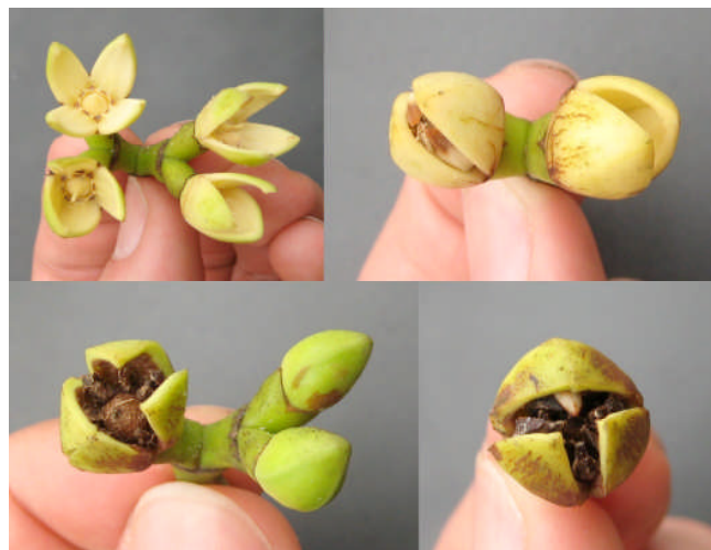
Fig. 2. Abnormal development of flowers of Rhizophora hybrid(s)

Inflorescences of the Rhizophora hybrid(s) usually had a pair (occasionally two pairs) of buds borne on a stout peduncle, similar to those of R. apiculata . This suggests that one of the putative parents may be R. apiculata . Despite having flowers, no fruits or propagules were found, unlike the other Rhizophora species. Taking a closer look at the hybrids, we found that most of the flowers had abnormal development (Fig. 2). One or two pairs of the calyx lobes were incompletely separated and reproductive parts were non-functional at anthesis. These observations are consistent with other studies that deemed Rhizophora hybrids to be sterile and/or limited to the F_1 stage (Lo, 2010; Parani et al. , 1997).