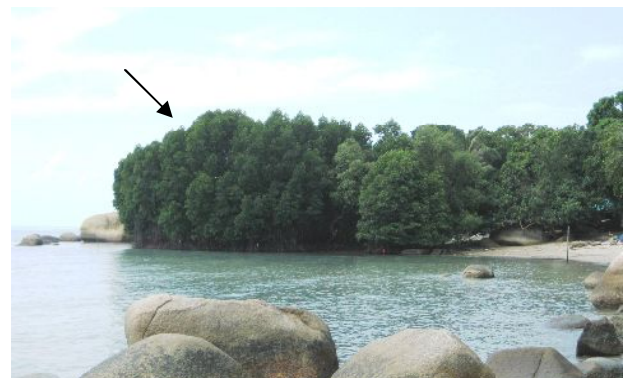
Fig. 3. Stand of R. stylosa at a promontory on Pulau Besar

Pulau Besar (2°06'N, 102°19'E) is an island about 10 min by speed boat from the mainland Umbai, Melaka. Trees of R. stylosa occur as pure stands on muddy sand flats at rocky promontories of the eastern and southern shores of the island. The stands were confined to the promontories (Fig. 3), suggesting that protection from waves and currents may be crucial for their establishment. Growing amongst the R. stylosa stands were scattered individuals of Avicennia and Sonneratia . Along the sandy beaches are Hibiscus tiliaceus , Calophyllum inophyllum , Anacardium occidentale , Ficus microcarpa , Casuarina equisetifolia , Eugenia grandis , Casuarina equisetifolia , Terminalia cattapa , Pandanus odoratissimus and Casuarina equisetifolia . In recent years, the development of several beach resorts has altered the pristine coastal environment.