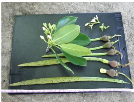
Fig. 1. Leaves, flowers and propagules of R. stylosa