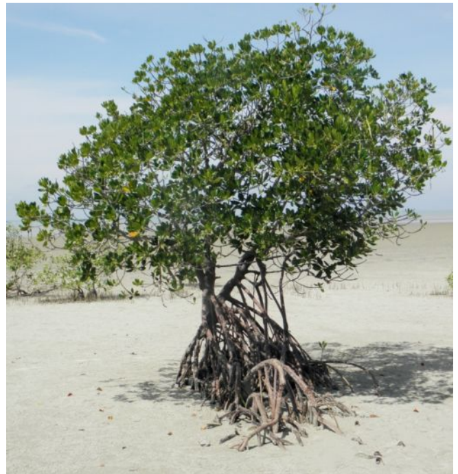
Fig. 2. A solitary R. stylosa tree in Bagan Lalang

Pulau Burung (2°32'N, 101°47'E) is a small islet off the coast of Si Rusa in Port Dickson, Negeri Sembilan. An elaborate wooden bridge and walkway provide access from the mainland to the islet. Rhizophora species, including hybrid(s), dominate the islet. The morphological features of the hybrid Rhizophora x lamarckii and its putative parents R. stylosa and R. apiculata have been described by Chan (1996), Chan & Wong (2009), and Ng & Chan (2012). The features of R. stylosa are summarised in Box 1. Other mangrove species included Bruguiera gymnorhiza , Ceriops tagal and Sonneratia alba .