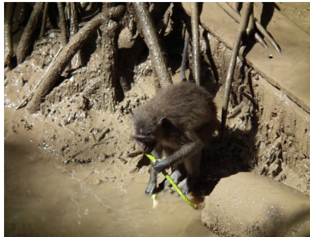
Fig. 1 Monkey actively investigating a Rhizophora propagule on forest floor, MFRC, Ranong, 2014

Observations and photographic evidence from the MFRC of Ranong, Thailand showed that macaques do select R. mucronata propagules as food, which presents a management challenge in terms of conservation forestry (Figs. 1, 2 & 3). There is evidence that the resident Macaca populations are increasing perhaps above that of former times in 1990's when immigrant workers hunted them for food. At present, the monkeys do not have natural enemies. The natural propagule productivity of Rhizophora spp. and K. candel ensures that these mangroves are reproductively and ecologically competitive. This together with an omnivorous dietary niche of Macaca implies, that under current conditions, the monkey predation is not yet of ecological concern. Should monkey populations expand exponentially due to say a change from a no-feeding to a feeding-allowed policy at the MFRC to cater for tourist interests, then this monkey factor could negatively impact on mangrove conservation.