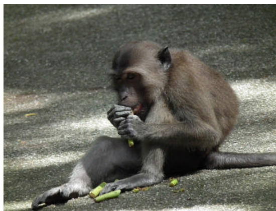
Fig. 3 Sustained predation with propagule ingested in bite-sized lots