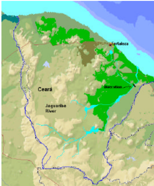
Figure 2. The Jaguaribe River in Ceará State, Northeastern Brazil

The Jaguaribe Basin (Fig. 2) covers about 72,000 km 2 , almost half of the State's territory and account for 70% of the total freshwater input to the adjacent Atlantic Ocean.