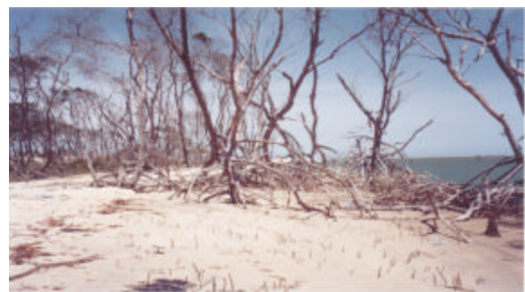
Figure 3. Sand accumulation in mangroves ecosystems, at the mouth of the Jaguaribe River, due to reduced supplies of fresh water and sediments in the estuary.

Mangroves require sedimentation rates of about 1 mm.yr -1 to keep pace with the general sea level rise (Ellison, 1993; Smoak and Patchineelam, 1999). Along many Ceará estuaries the supply of sediments is much less than that, particularly at the Jaguaribe River, resulting in erosion and death of mangrove trees. Erosion of mangrove mud results in high suspended matter load into the incoming tide (Fig. 3), bringing mud inland, further increasing the erosive force of tides and allowing the deposition of marine sands brought along the coast by prevailing SE trade winds. This accelerates mangrove trees destruction by high sedimentation by marine sands.(Fig. 3).