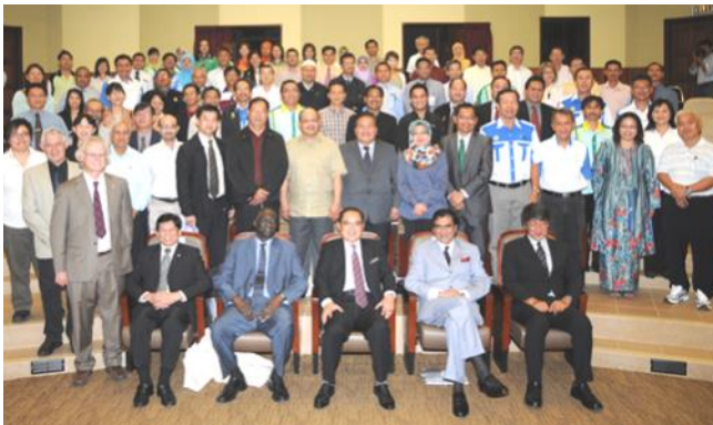
Eight General Assembly of ISME and ISME-SFD workshop on mangroves held at Rainforest Discovery Centre, Sandakan, Sabah.

The Eighth General Assembly (GA) of ISME was held in the Rainforest Discovery Centre, Sandakan, Sabah on 13 September 2011. The Honourable Datuk Peter Pang (Minister of Youth and Sports of Sabah) graced the occasion and presented the Opening Address on behalf of The Right Honourable Datuk Seri Panglima Musa Hj. Aman (Chief Minister of Sabah). Welcoming remarks were delivered by Datuk Sam Mannan (Director of Sabah Forestry Department) and Prof. Salif Diop (President of ISME, 2005-2011). Among the highlights of the GA were the Announcement of the Executive Committee (2011-2014), Activities and Finance, Revision of the Statutes, and Award Ceremony. The GA was attended by participants from Malaysia, Thailand, Australia, France, Japan and India.