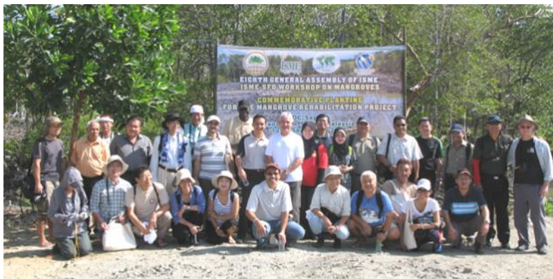
Mangrove and other coastal species were planted at Sg. Lalasun, Sandakan in commemoration of the SFD-ISME Collaborative Mangrove Rehabilitation Project.

In conjunction with the GA, the Executive Committee (EC) met on 12 and 15 September 2011. Among the agenda discussed were: